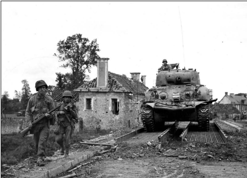
M4 Sherman, St. Fromand, France, Normandy, 1944. Note sniper at left with scoped M1903 Springfield

4625 Brandingshire Pl., Fort Worth, TX 76133